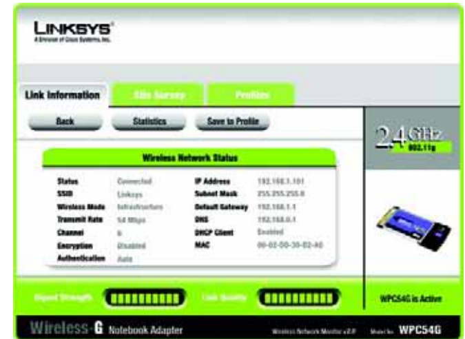
Figure 6-2: Wireless Network Status

Click the Statistics button to go to the Network Statistics screen. Click the Back button to return to the initial Link Information screen. Click the Save to Profile button to save the currently active connection to a profile.